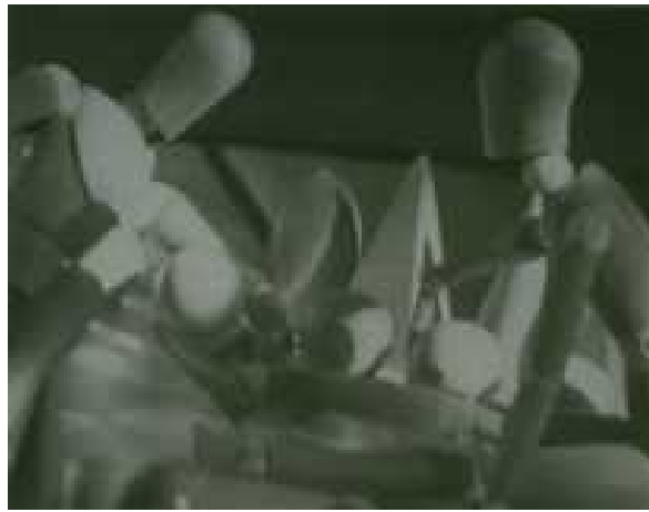
"End Game" 1942 Vintage Gelatin Silver Print by Man Ray, from The Sandor Family Collection

The (art) n group continued to explore interactivity in several areas, including the additional element of interactive sound to PHSCologram sculptures, such as Telomeres Project on Imminent Immortality shown in the N-Space Gallery at SIGGRAPH 2001 in Los Angeles. (art) n also spearheaded interdisciplinary research projects to develop practical applications for artists to experiment with digital 3D photography in Virtual Reality environments. This resulted in the collaborative development of IGrams for the Electronic Visualization Laboratory's CAVE at University of Illinois at Chicago, and other satellite research institutions. The IGram project was initially developed 1998-1999, and offers Virtual Reality artists an alternative way to capture their content, anticipating what perhaps may be the screenshot medium of the future. Moreover, the combination of (art) n 's content and development of the PHSCologram medium offers a glimpse into the future of what video games could look like, and how they can represent a rich collection of ideas supported by even more diverse, alternative voices.