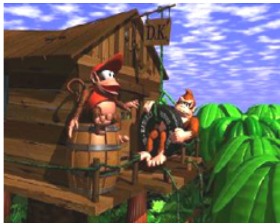
"Donkey Kong Country" 1994 PHSCologram by Rare & (art) n

These works were first shown in 1995 by Oskar Friedl Gallery in Chicago, in The Equation of Terror-Interactive Pop Terrorism . This noteworthy exhibition also included virtual portraits of early virtual actors created by Brad deGraf, SimGraphics, and Chris Landreth, and (art) n 's 1991 political installation, The Equation of Terror . This intriguing body of work was juxtaposed with columns of video monitors, configured with a Super NES for visitors to play Donkey Kong Country . The well-attended show received a controversial review by Chicago's New Art Examiner for its daring juxtaposition of game content with WWII images and terrorism themes.