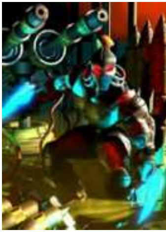
"Killer Instinct" 1995 PHSCologram, by Rare & (art) n